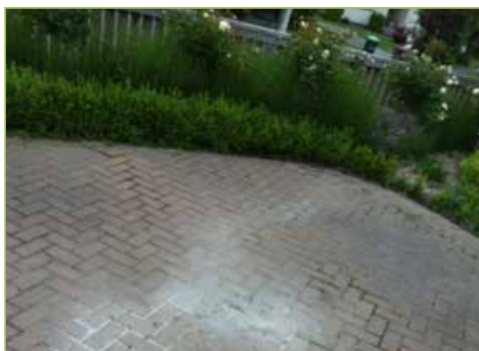
Undulating paving slabs