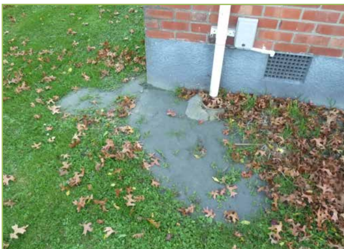
Isolated area of liquefaction ejecta on lawn