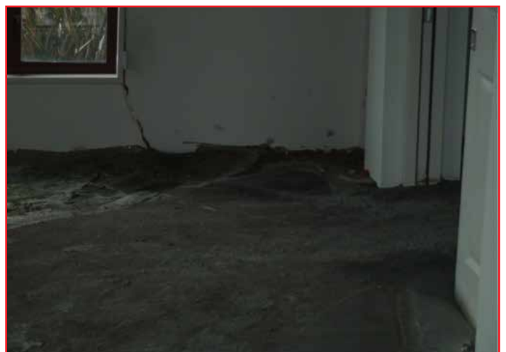
Large amounts of liquefaction ejecta inside dwelling