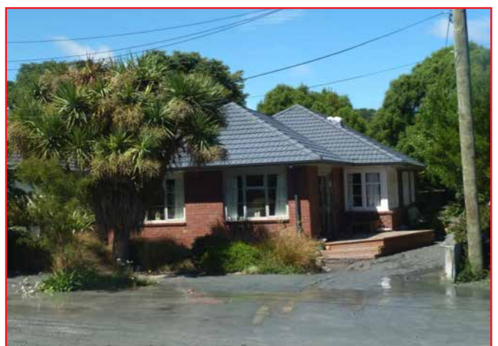
s) Foundation damage, tilting dwelling