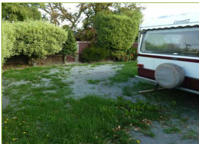
Liquefaction ejecta on lawn