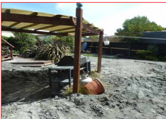
Liquefaction ejecta around property