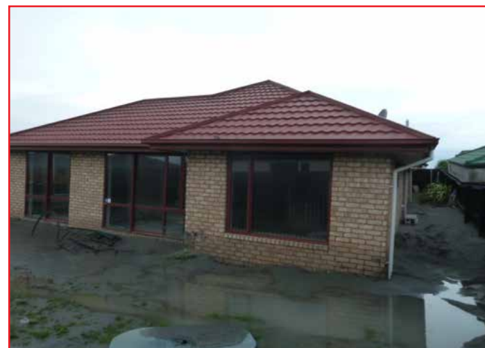
Large amounts of liquefaction ejecta around property