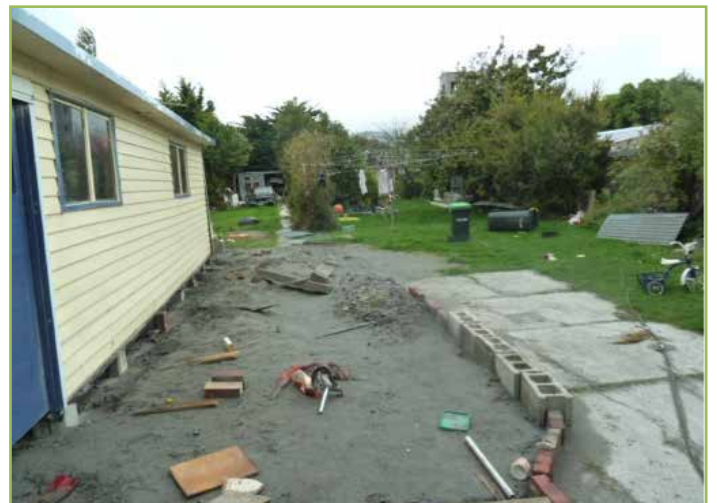
Large area of liquefaction ejecta on lawn