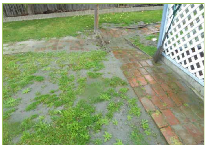
Undulations in lawn, liquefaction ejecta removed