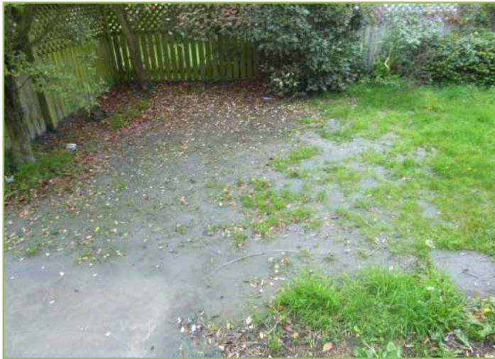
Liquefaction ejecta on lawn