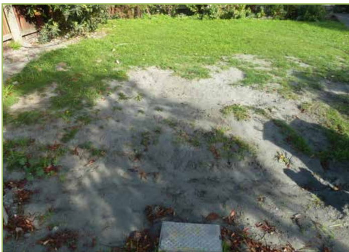
Liquefaction ejecta on lawn