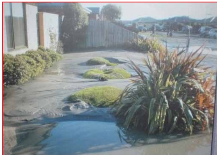
Large amounts of liquefaction ejecta