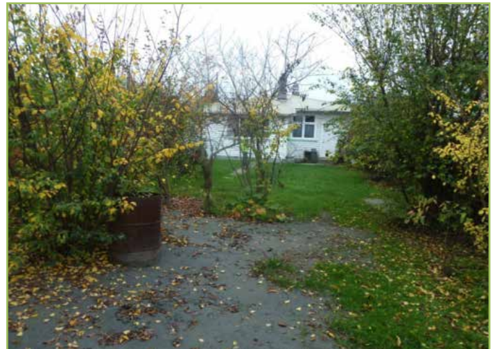
Liquefaction ejecta on lawn