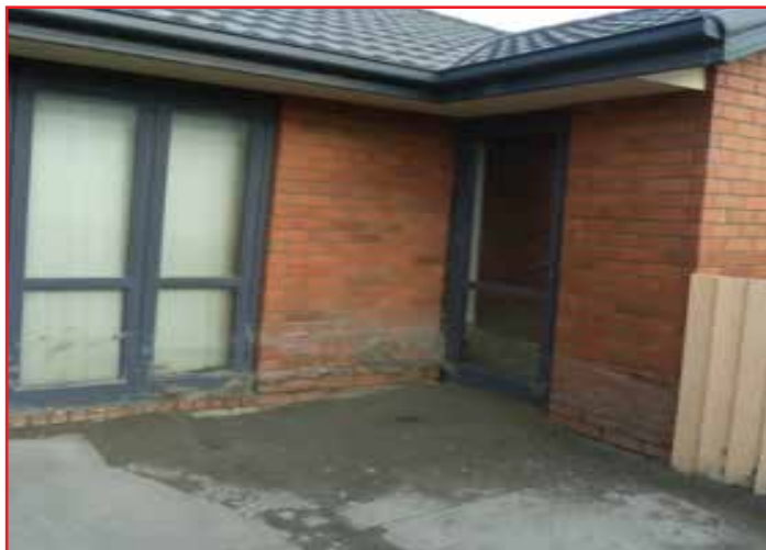
Outside of dwelling showing level liquefaction ejecta reached on brickwork and windows