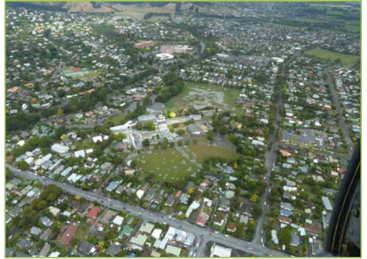
Aerial photo of liquefaction ejecta at Cashmere High School