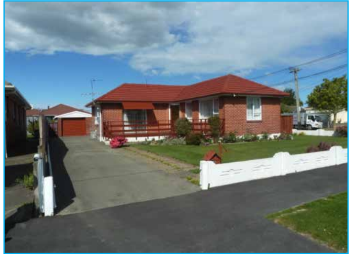
Slightly undulating lawn and driveway