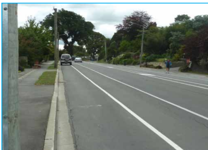
View of Centaurus Road with little damage