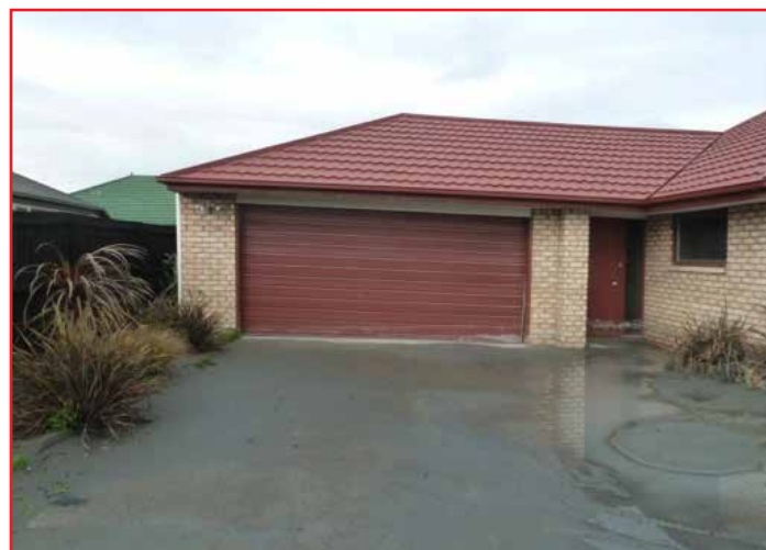
Large amounts of liquefaction ejecta and tilting dwelling