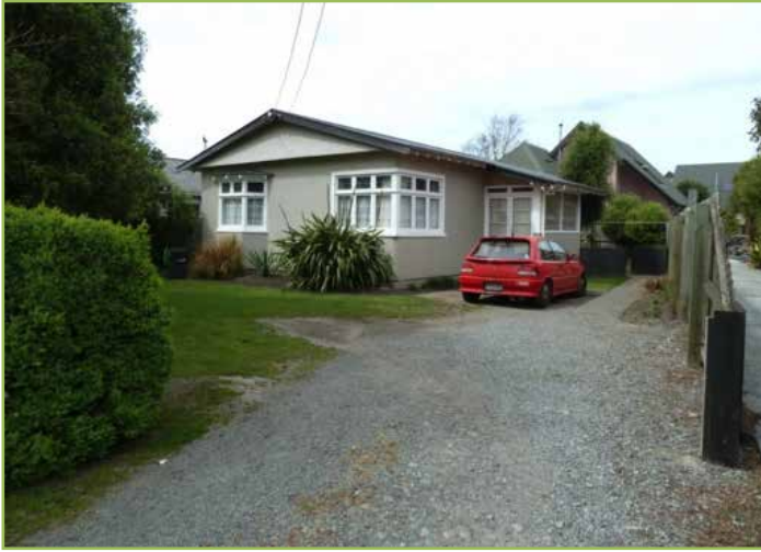
Undulating lawns and liquefaction ejecta