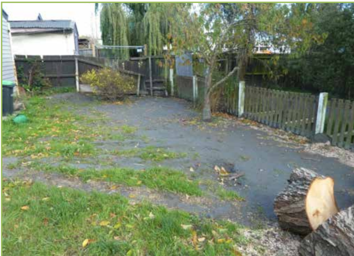
Liquefaction ejecta on lawn