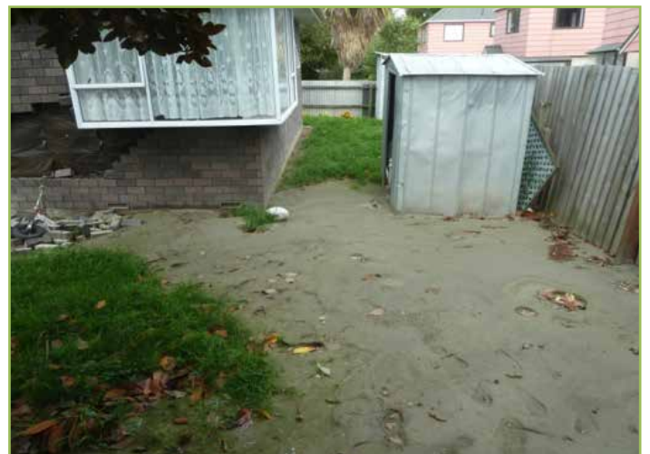
Liquefaction ejecta and brickwork damage