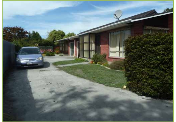
Undulations in lawn