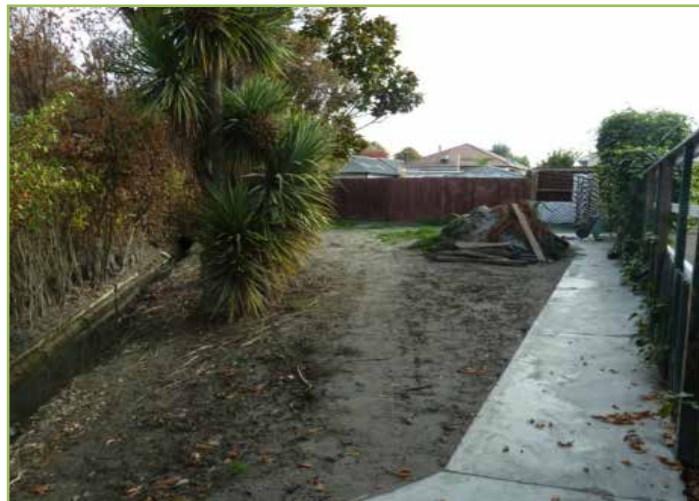
Liquefaction ejecta alongside culvert