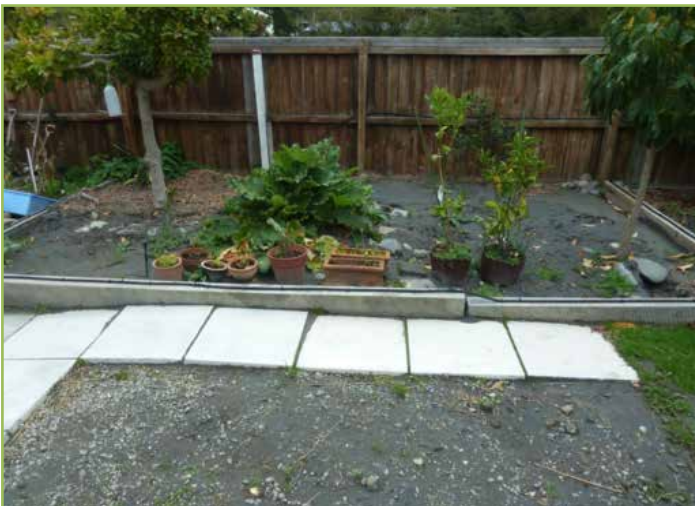
Liquefaction ejecta in planter with undulating pavers