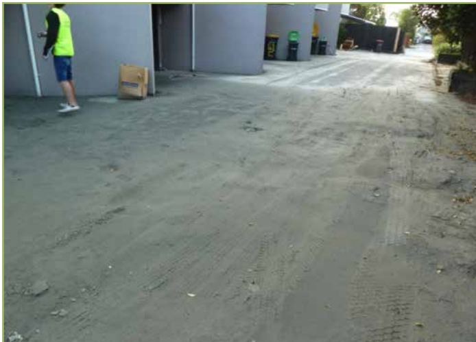
Liquefaction ejecta covering driveway