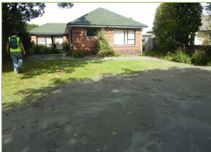
Liquefaction ejecta, dwelling tilting