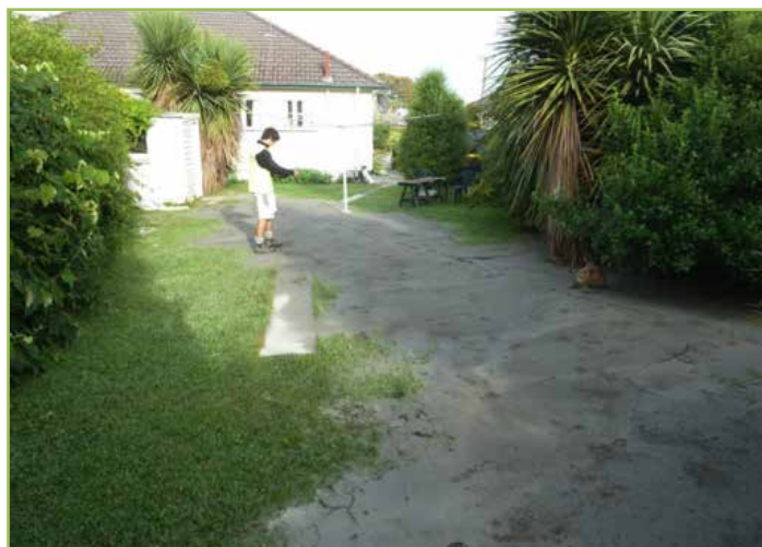
Liquefaction ejecta on lawn