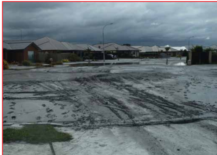
Liquefaction ejecta in turning circle of Seabreeze Close