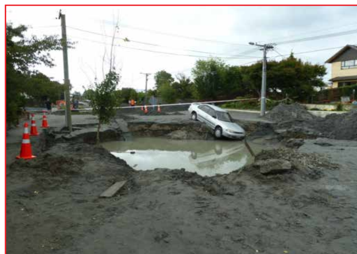
Close up photo of road damage seen in aerial photo of Woolston