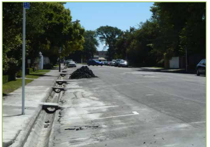
Liquefaction ejecta pile on road