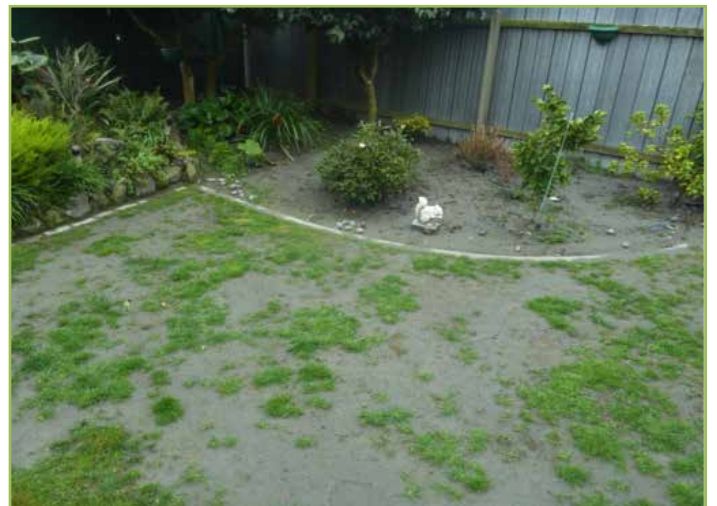
Liquefaction ejecta on lawn