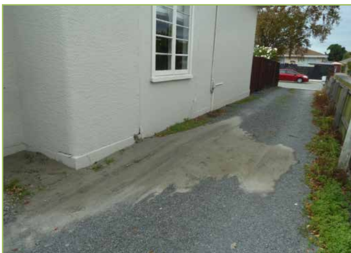
Isolated area of liquefaction ejecta