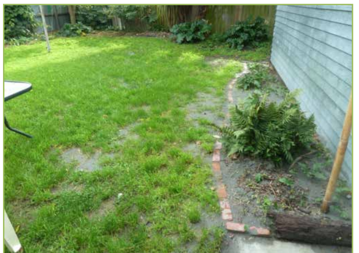
Isolated area of liquefaction ejecta on lawn