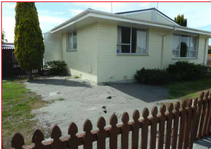
Large patch of liquefaction ejecta