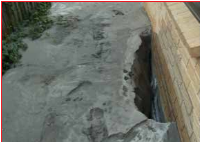
Large amounts of liquefaction ejecta