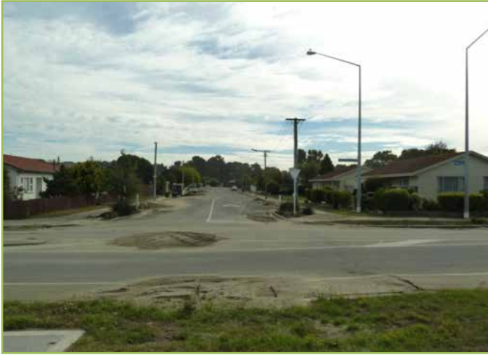
Liquefaction ejecta at a New Brighton Road junction