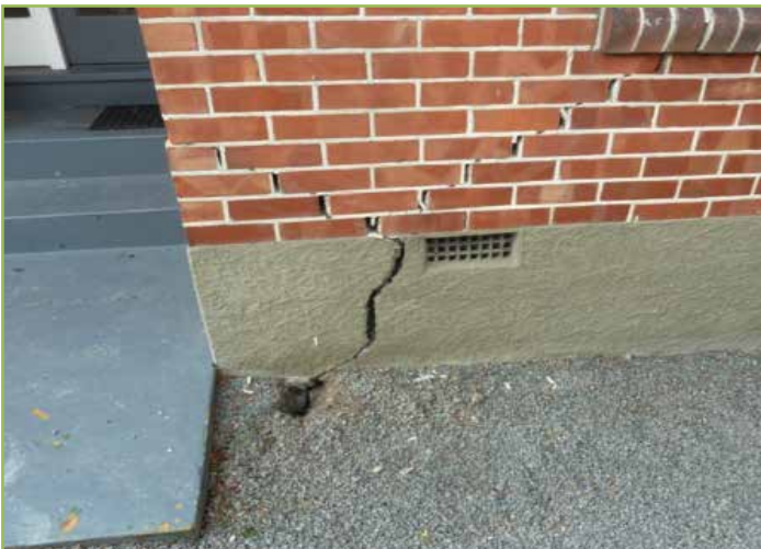
Foundation and brickwork damage