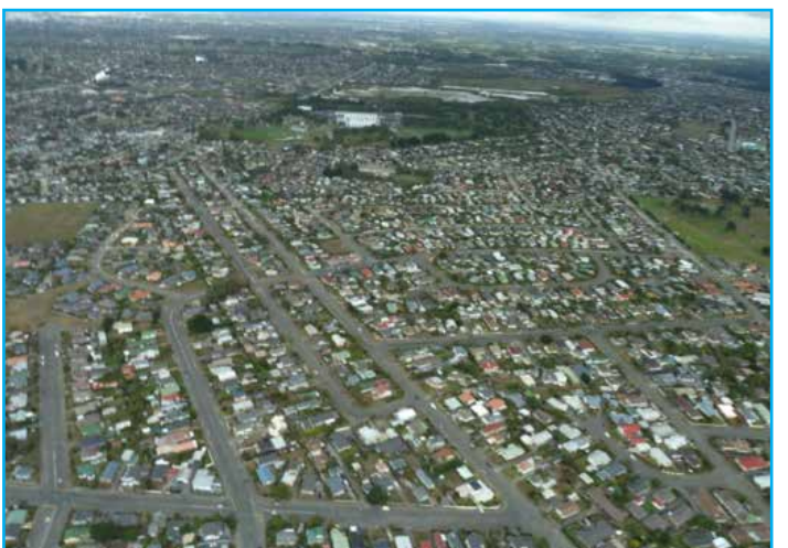
Aerial photo of North New Brighton showing little damage