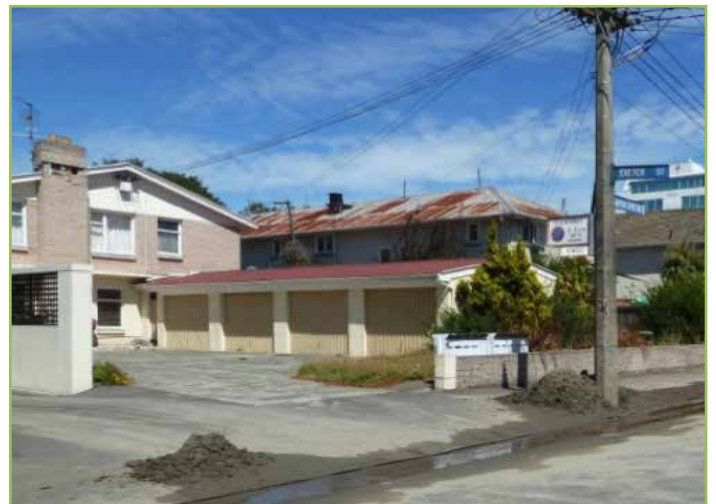
Piles of sand along the footpath