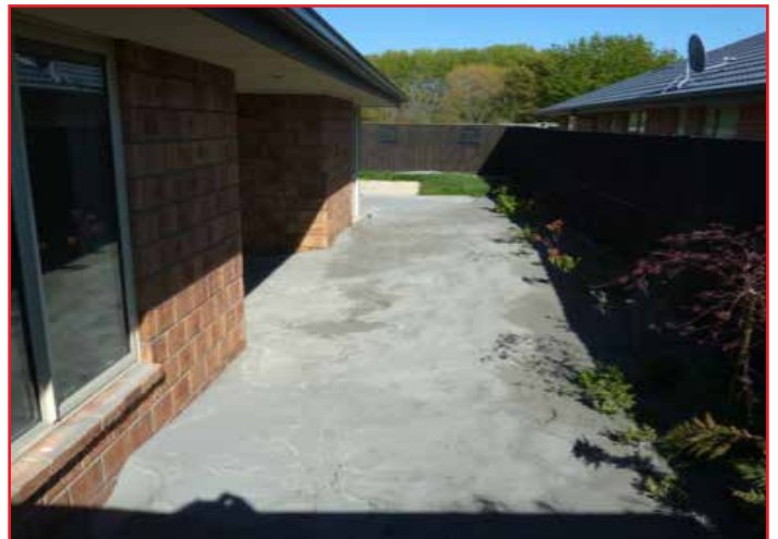
Large amounts of liquefaction ejecta