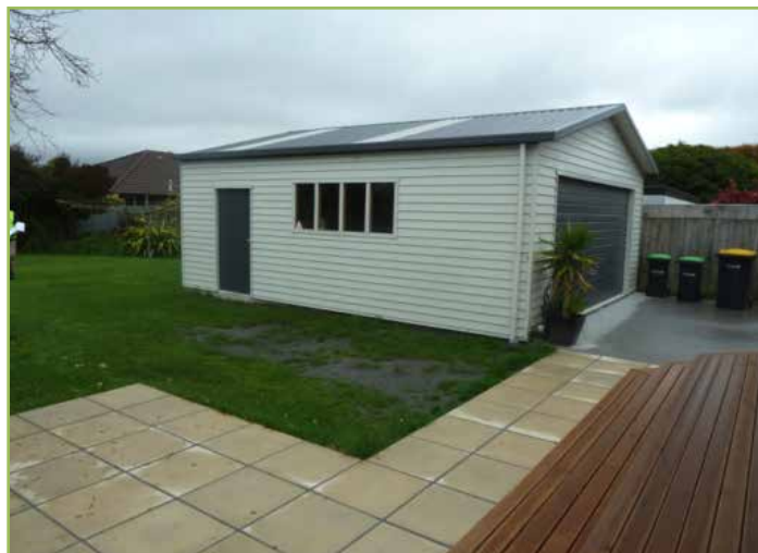
Liquefaction ejecta on lawn