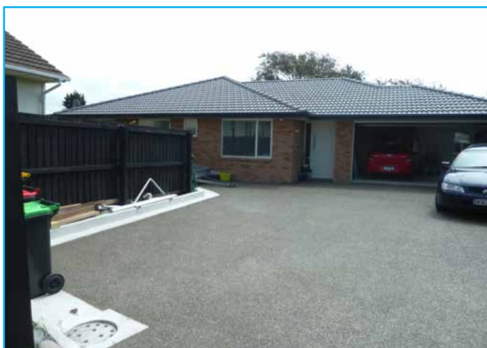
Undamaged concrete driveway and kerbing