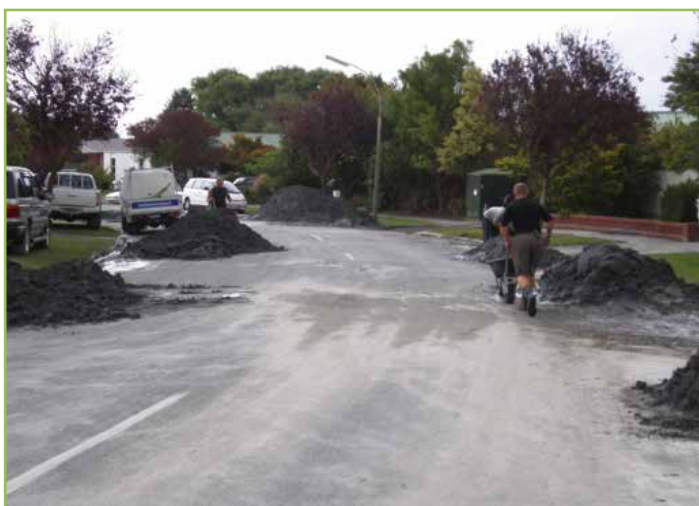
Liquefaction ejecta in piles on road