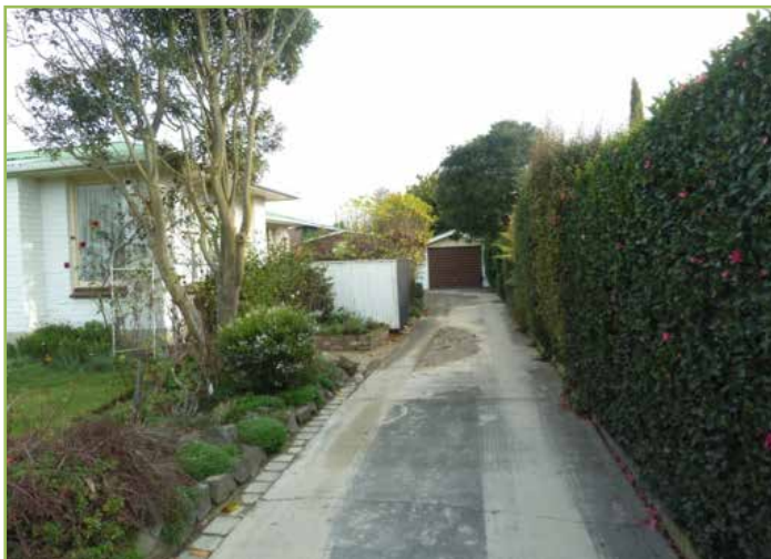
Undulations on road with ponding water