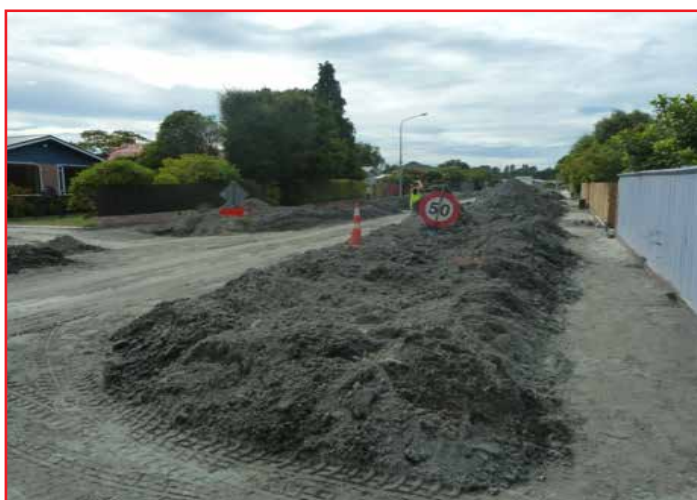
Liquefaction ejecta piles along Avonside Drive