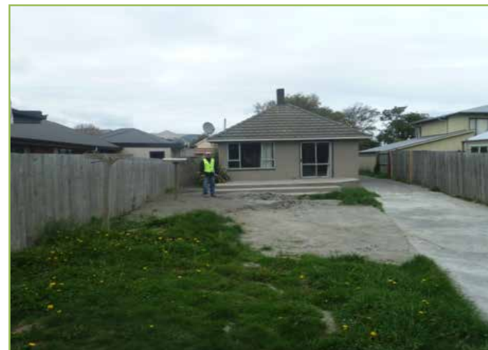
Liquefaction ejecta, dwelling tilting