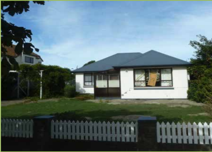
Liquefaction ejecta in many areas on lawn