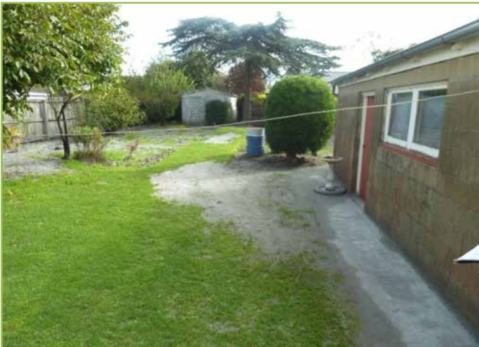
Liquefaction ejecta in many places on lawn