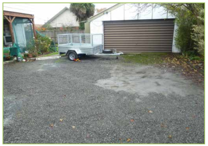
Isolated area of liquefaction ejecta