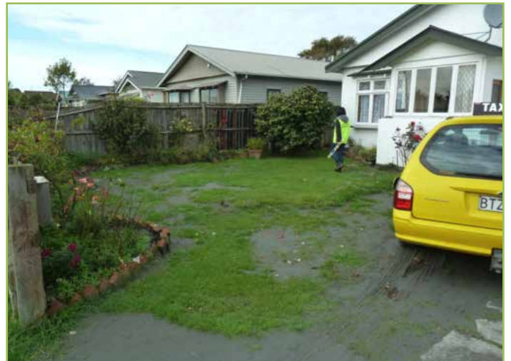
Liquefaction ejecta on lawn