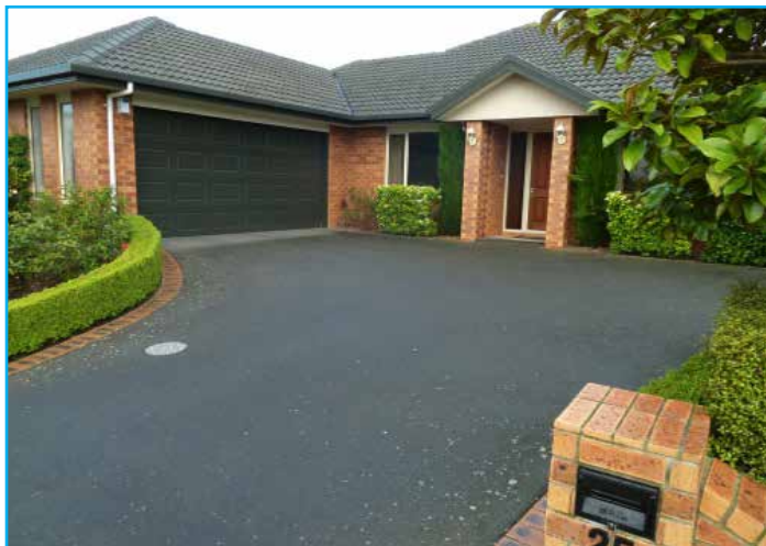
Undamaged asphalt driveway