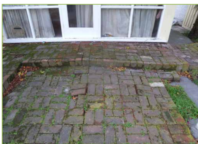
Undulating paving bricks