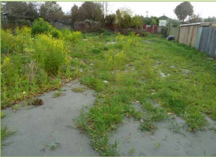
Liquefaction ejecta on lawn