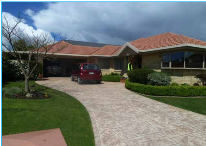
Even lawns and undamaged pavers