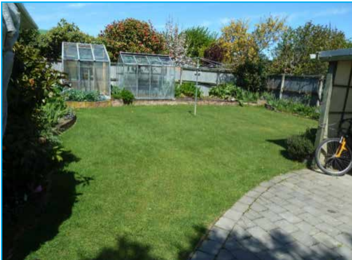
Slightly undulating lawn