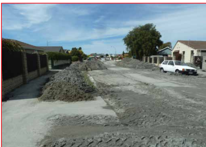
Liquefaction ejecta piles along Androssan Street