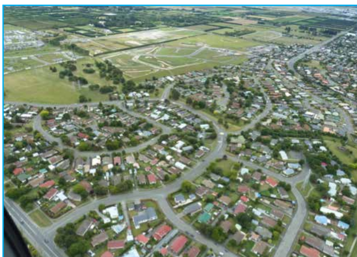
Aerial shot of Broomfield area showing no liquefaction ejecta on the roads or Broomfield Common