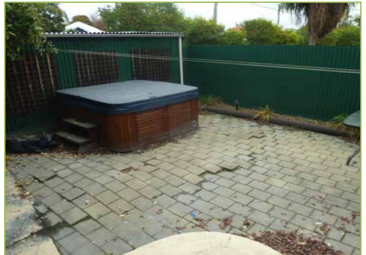
Undulations in paving area