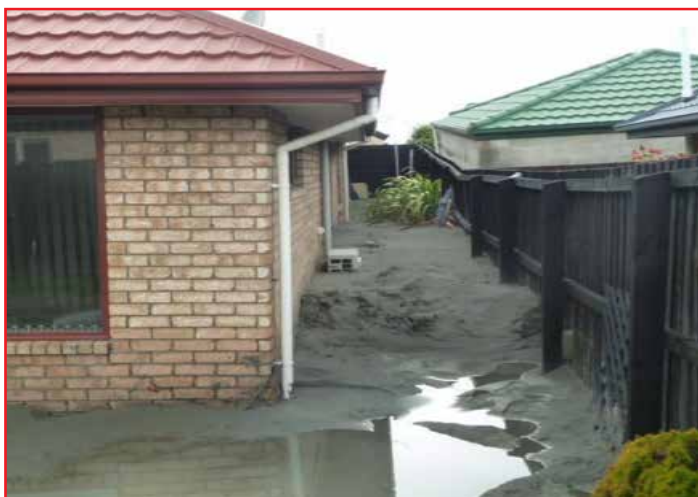
Large amounts of liquefaction ejecta