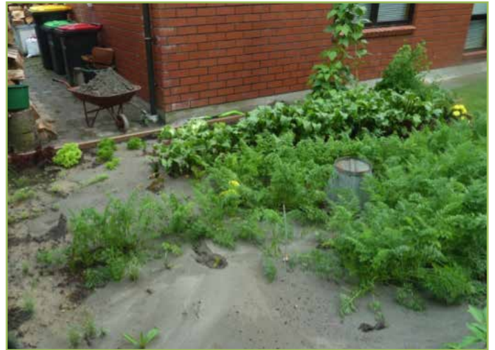
Liquefaction ejecta in planter