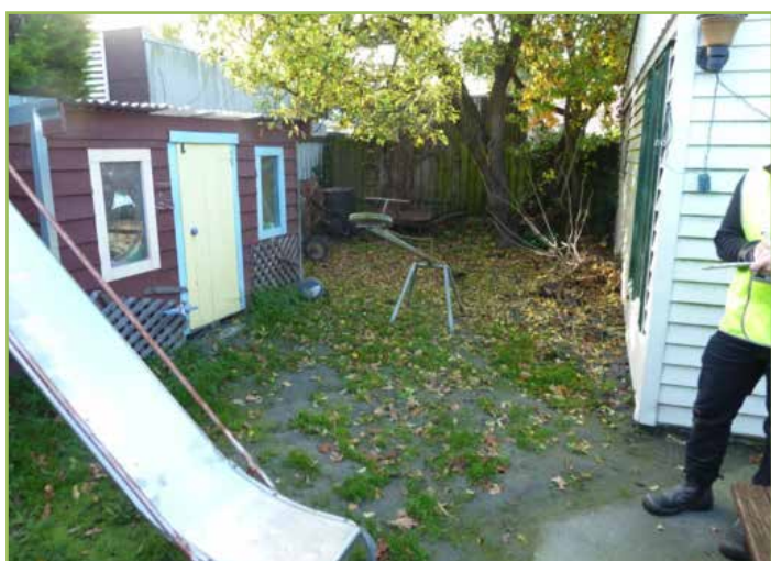
Liquefaction ejecta on lawn