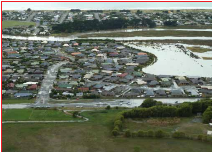
Aerial photo showing liquefaction ejecta on Seabreeze Close