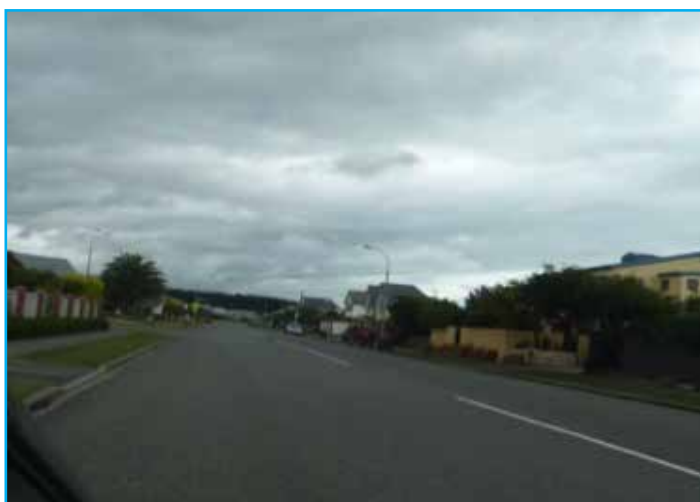
View of Aston Drive with little damages