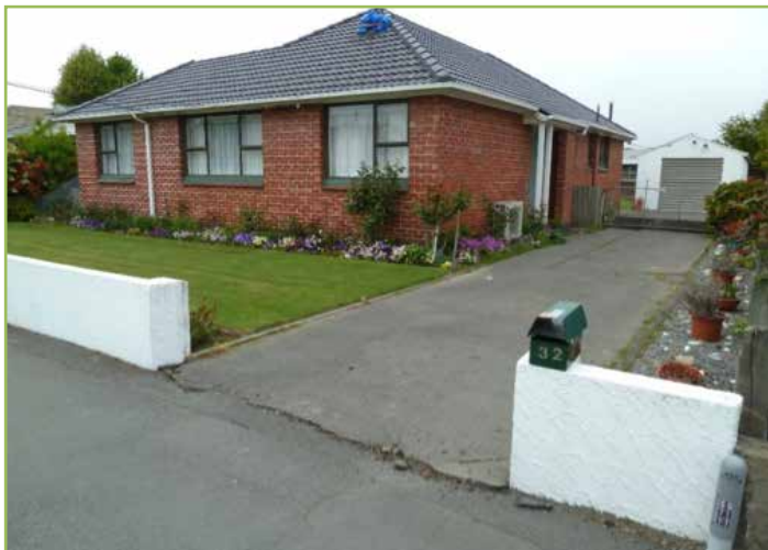
Damage to asphalt