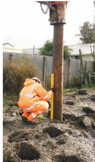
Above and below: Timber pole installation during the Ground Improvement Pilot Project, using a vibratory plate fixed to an excavator

One advantage of driven timber poles it that they can easily be installed on smaller properties or those with restricted access, close to property boundaries and against fences and other obstacles.