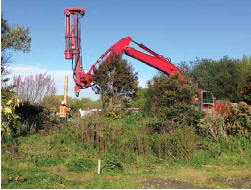
Left: Driven timber pole installation during the Ground Improvement Pilot Project using a pile-driver mounted on an excavator