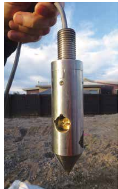
Crosshole probe sensor