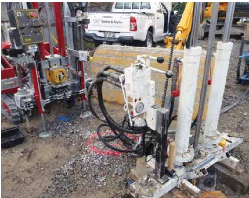
Equipment used push probes into the ground

A crosshole geophysical test is performed using two special probes that are pushed into the soil using small machines with hydraulic rams. Both probes are pushed in vertically and parallel approximately 1.5m apart and in small depth increments. The probes are mounted at the tip of a rod string and measure the shear wave velocity between the two probes. Shear waves are generated by striking the push rods (attached to the probes in the ground) with hammers. One probe acts as an emitter of the shear waves, the other as the receiver of the waves generated in the first probe.